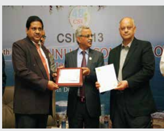
CSI-Nihilent e-Governance Award 2012-13