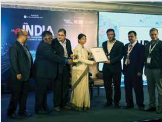
eINDIA Digital Transformation Award 2018