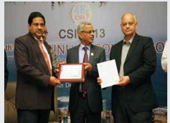
CSI-Nihilent e-Governance Award 2012-13