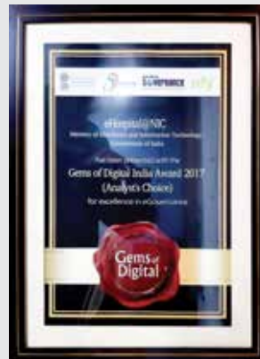
Gems of Digital India Award 2017